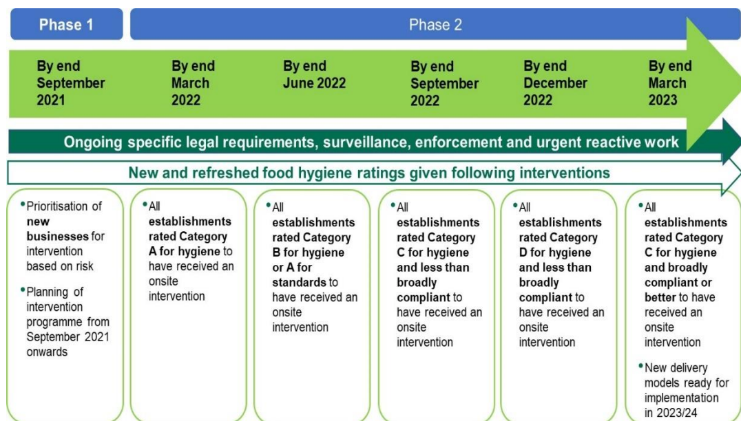
Figure 3: FSA COVID-19 Local Authority Recovery Plan

Progress against the FSA COVID-19 Recovery Plan has been reported to the Joint Committee throughout the year, and it was confirmed in February 2023 that the Recovery Plan would be withdrawn at the end of the 2022/23 financial year. The Service met with the FSA in March 2023 to agree a bespoke solution for bridging the gap between the Recovery Plan and resumption of the full SRS Food programmes.